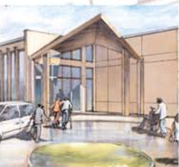
Images (top to bottom) 1. Hammond-Henry Hospital, Geneseo, Illinois. 2. Keokuk County Health Center, Sigourney, Iowa. 3. Massac Memorial Hospital, Metropolis, Illinois.

The $13.2 million project will set in motion a major modernization of the 50 year old facility, providing more adequate access to health care services for residents of Metropolis and the surrounding rural areas currently served by the hospital. Massac is working with Durrant, a healthcare focused architectural firm based out of St. Louis, MO on the facility expansion project. Three additions totaling approximately 20,000 square feet are planned to house the all-new emergency department, same-day surgery department, clinical laboratory, patient registration, imaging department and main entrance and new private acute care patient rooms.